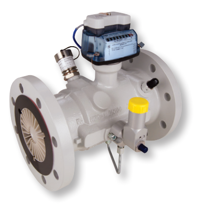
Fluxi 2000/TZ fitted with the universal totaliser and the Cyble Sensor ATEX